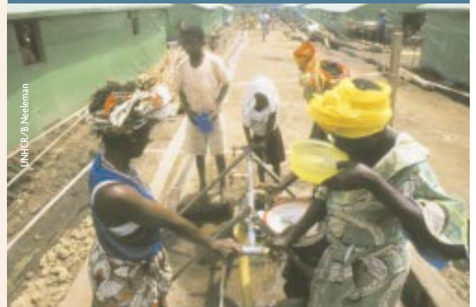
Sierra Leonean refugees in Katkama camp, Guinea