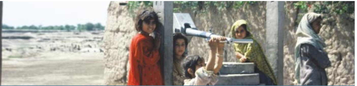
Afghan returnee children draw water from a well