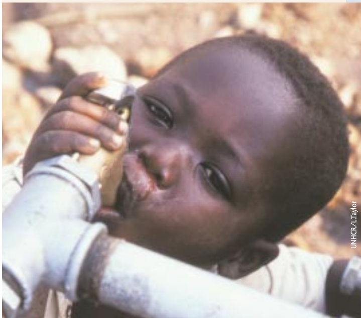
Water supply for Sudanese refugees in Fugnido camp, Ethiopia